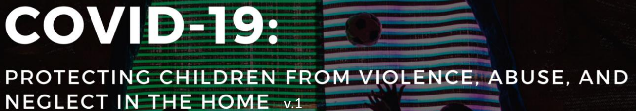
Burkina Faso 2019