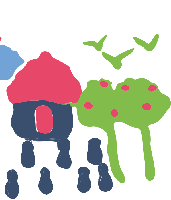
Illustration from the Children Consultations for the 2023 Global Refugee Forum in Thailand

Many children said they want access to mental health services because most refugee children need help but cannot access it. Many feel unhappy because they don't feel like they belong, especially when children from the local community treat them as "different." When asked what feeling happy meant for them, they often mentioned fitting in and being accepted by others.