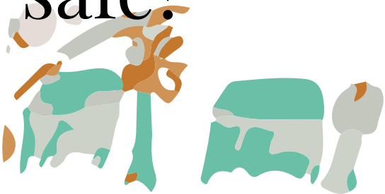
Illustration from the Children Consultations for the 2023 Global Refugee Forum in Thailand

“Mom and Dad stayed on land, and we children went on the boat. The boat was rocking, and then people with masks came...I was afraid.”