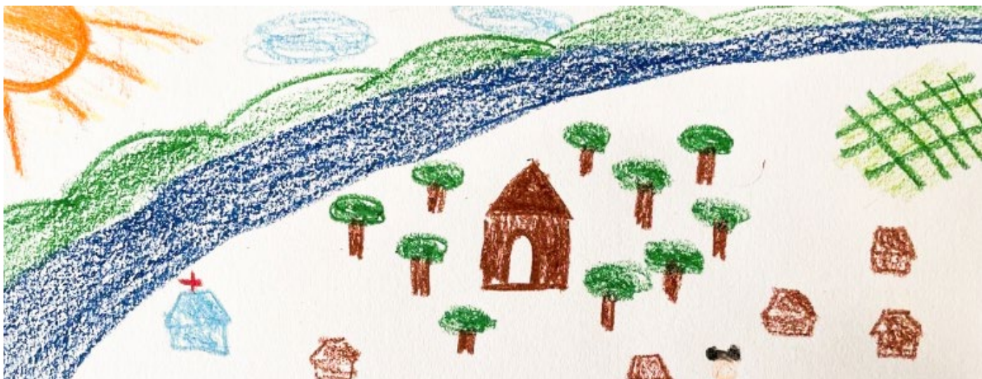
Illustration from the Children Consultations for the 2023 Global Refugee Forum in Thailand