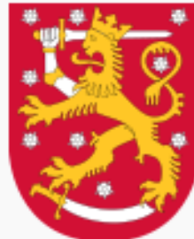
Coat of arms